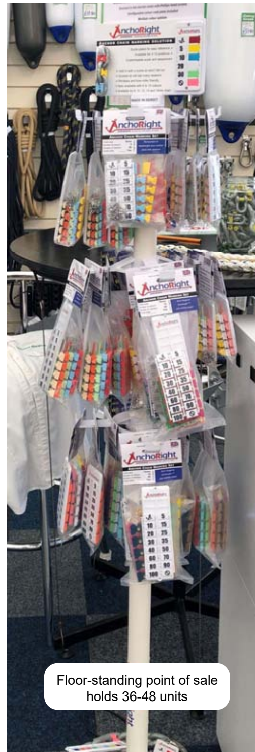
Floor-standing point of sale holds 36-48 units

The simple and consistent branding helps to strengthen the recognition of the product across your territory.