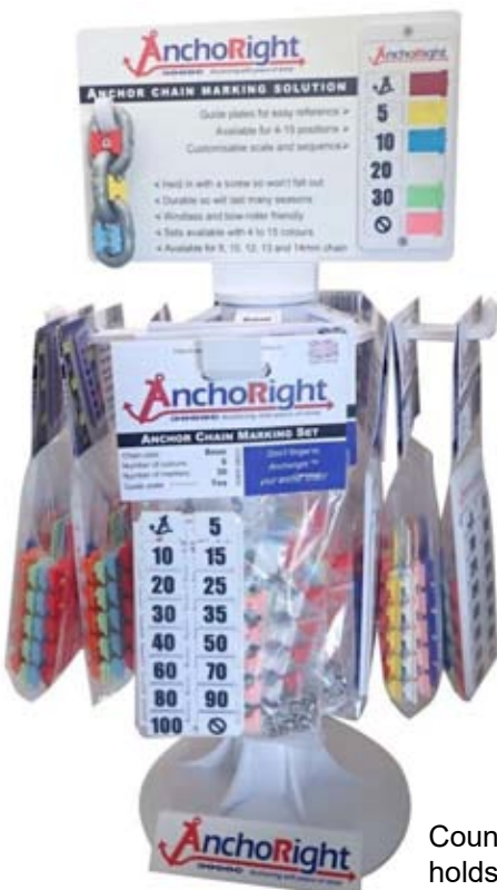
Counter top point of sale holds 12-16 units

All of our point of sale aids are free of charge to chandlers stocking our product and are provided through your local distributor with an initial minimum order of product to stock the unit.