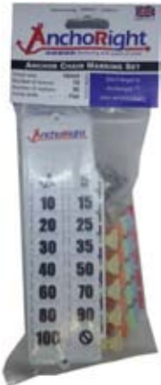
Chain marking set

Anchorright Chain Marking sets are becoming increasingly popular with both online and physical retail outlets. Growing interest and increased number of recommendations from within the boating community has resulted in Anchorright becoming one of the hottest new products for online and retail chandlers.