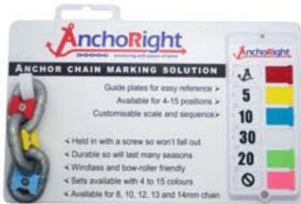
Retail hanging card

Getting hold of Anchorright product is as easy as calling your territory distributor, see above, who has exclusive selling rights in their territory. If you're unsure as to who that may be get in touch and we'll point you in the right direction.