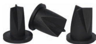
Check Valve Included