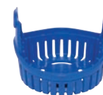
Strainer Base 1232R